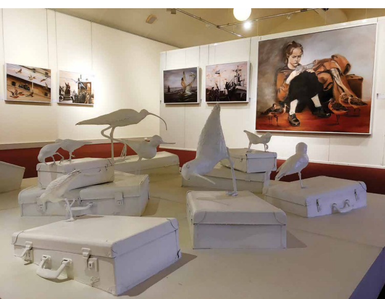
Overview of Australien Future - tales of migration , Gladstone Regional Art Gallery & Museum, 2019.