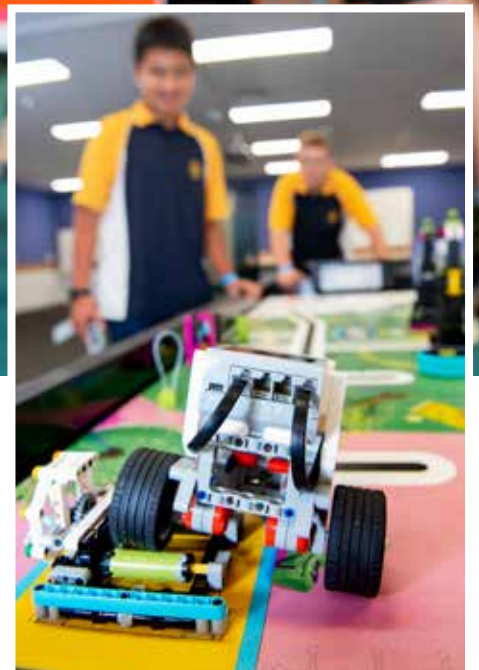
Sharks and Calliope State School's RoboTRACKS.

The Champion's Award was won by Chanel College's Chanel Crocs, who will proceed to the State Competition in Brisbane in December, along with Gladstone State High School's Rekin