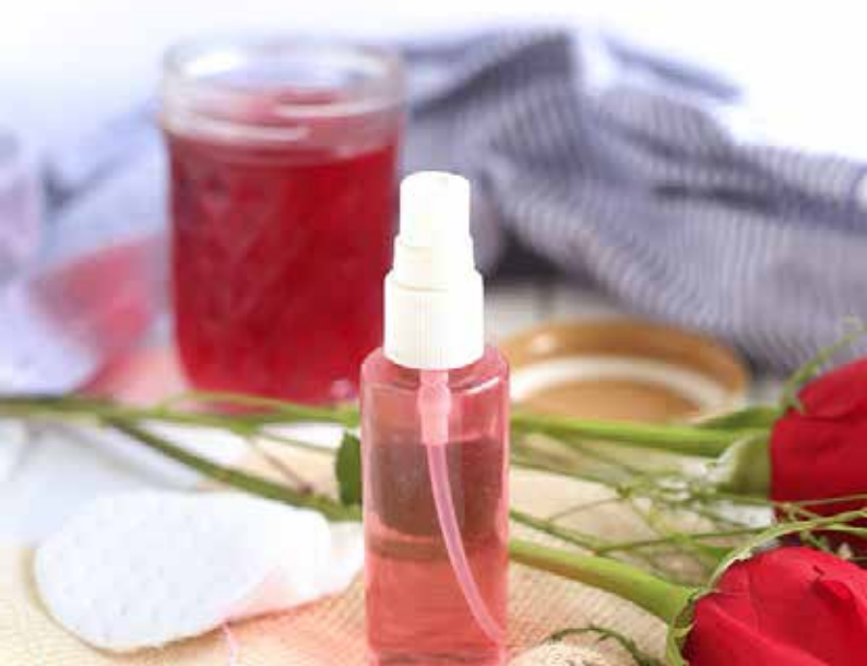
Image and Recipe Credit: https://www.thehealthymaven.com/how-to-make-homemade-rosewater/