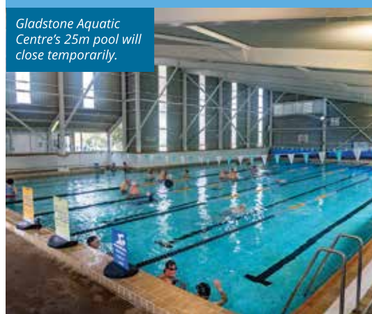
Gladstone Aquatic Centre's 25m pool will close temporarily.

Applications NOW OPEN for funding opportunities through our