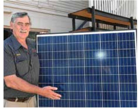
MURRAY Solar Power Gladstone

"It's so amazing to be part of a community where small business owners support other businesses as well. I love Gladstone and I feel that it's a great place to own a small business."