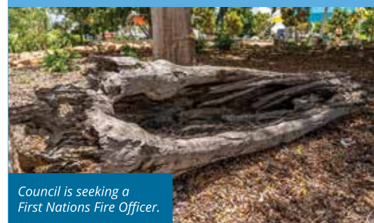
Council is seeking a First Nations Fire Officer.

The First Nations Fire Officer position has been made possible by funding from the Australian Government's Black Summer Bushfire Recovery Grants Program.