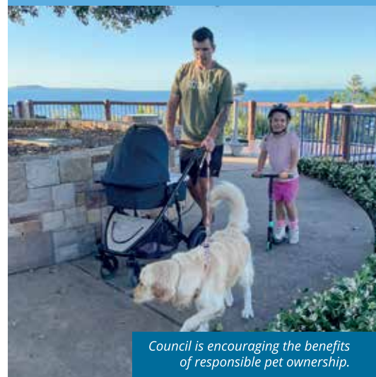
Council is encouraging the benefits of responsible pet ownership.

Visit www.gladstone.qld.gov.au/microchipping for more information about the benefits of microchipping your pet, or visit www.gladstone.qld.gov.au/registration for more information about animal registration.