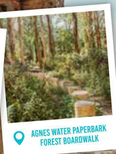
AGNES WATER PAPERBARK FOREST BOARDWALK