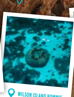
WILSON ISLAND BOMMIE