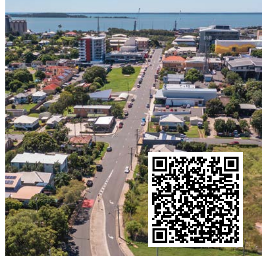
Scan the QR Code to learn more about doing business with Gladstone Regional Council.

"We are proud to play our part in facilitating this project for The Shelter Collective and this is a fantastic example of our Development Services team working to achieve positive outcomes for the community." The project is expected to be complete in April 2027.