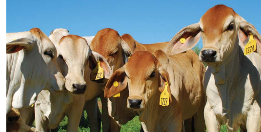
Council is hosting a primary industry breakfast at Nagoorin on 29 June.

RSVPs are essential and required by Monday 22 June. Visit www.gladstone.qld.gov.au and search for 'Industry Breakfast - Beyond the Farm Gate' to register.